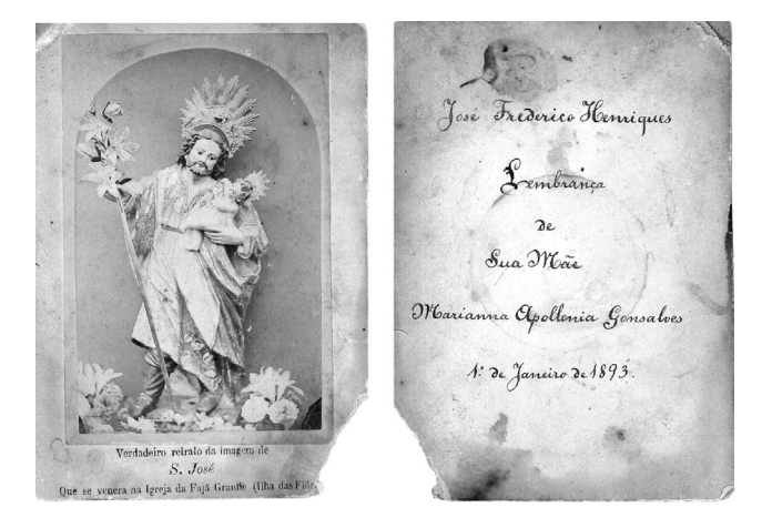
Figure 2. Memento from Fajã Grande, Flores, to Grandpa from his Mother, 1893.

• Among my aunt's effects were an 1893 religious memento (Figure 2) from